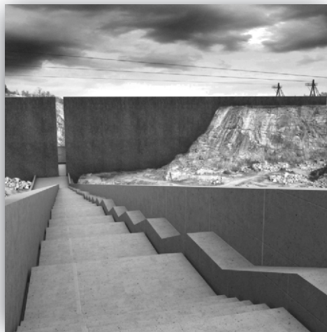
Monumental concrete stairs, and corroded wall