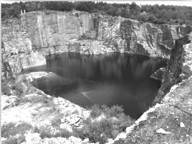
The quarry – place of implementation of the project (contemporary view)